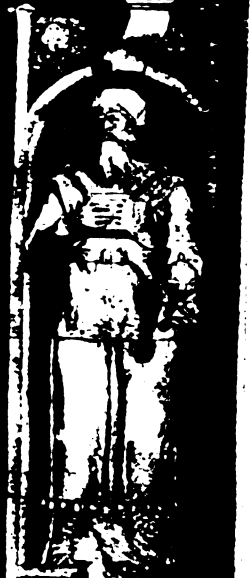
The authorised version of the English Bible, 1611